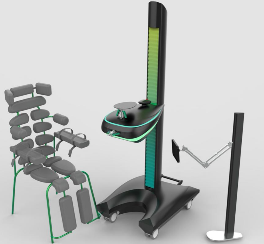
*Mobi-L : Concept Design of Launch Version